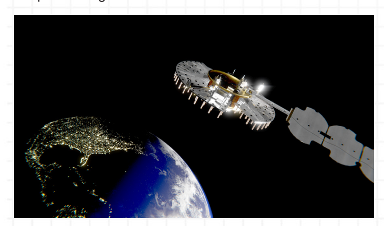
Artist's concept for NTS-3 in geostationary orbit. Harris Corporation will integrate NTS-3 using Northrop Grumman's ESPAStar bus, building on EAGLE's flight heritage.

Together with industry, the Air Force Research Laboratory (AFRL) is developing advanced techniques and technologies to detect and mitigate interference to PNT capabilities and increase system resiliency for military, civil, and commercial users. To test these new capabilities in hardware, software and concepts of operations, NTS-3 will operate for one year in Geosynchronous Earth Orbit. Ultimately, NTS-3 will identify key aspects for new GPS receivers that incorporate multiple signals and readily adapt to warfighter needs.